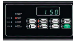
Fully programmable NetMaster™ control

Our advanced NetMaster™ control makes it easy for customers to locate the vend price, cycle selections, cycle status, and remaining cycle time. Customers will appreciate knowing the status of their laundry and the ability to be more efficient with their time.