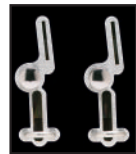
Dual Coin Drop

Speed Queen lets you customize your activation options. Our coin drop, with its all-metal design, reduces coin jamming and provides superior coin validation.