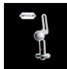
World Coin Drop

Dual coin drop for International use and a USA dual coin conversion are also available.