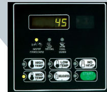
Quantum™ Dryer Control