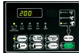
Quantum™ Washer Control